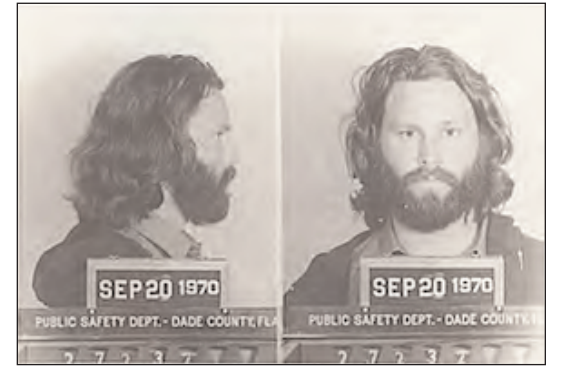
Morrison's Mug Shot the Day he was Found Guilty

Jim was found guilty on misdemeanor counts of indecent exposure & "open profanity"